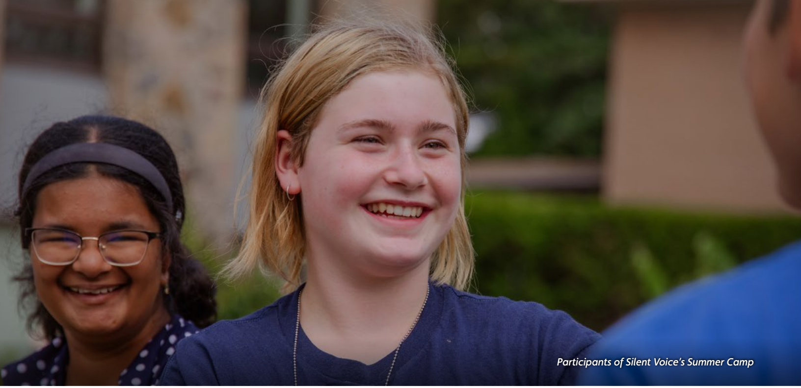
Participants of Silent Voice's Summer Camp