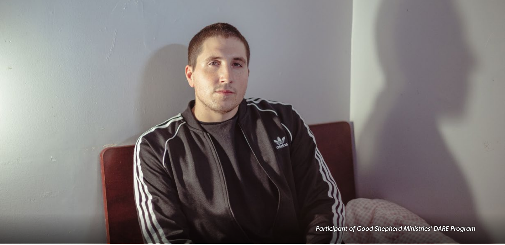
Participant of Good Shepherd Ministries' DARE Program