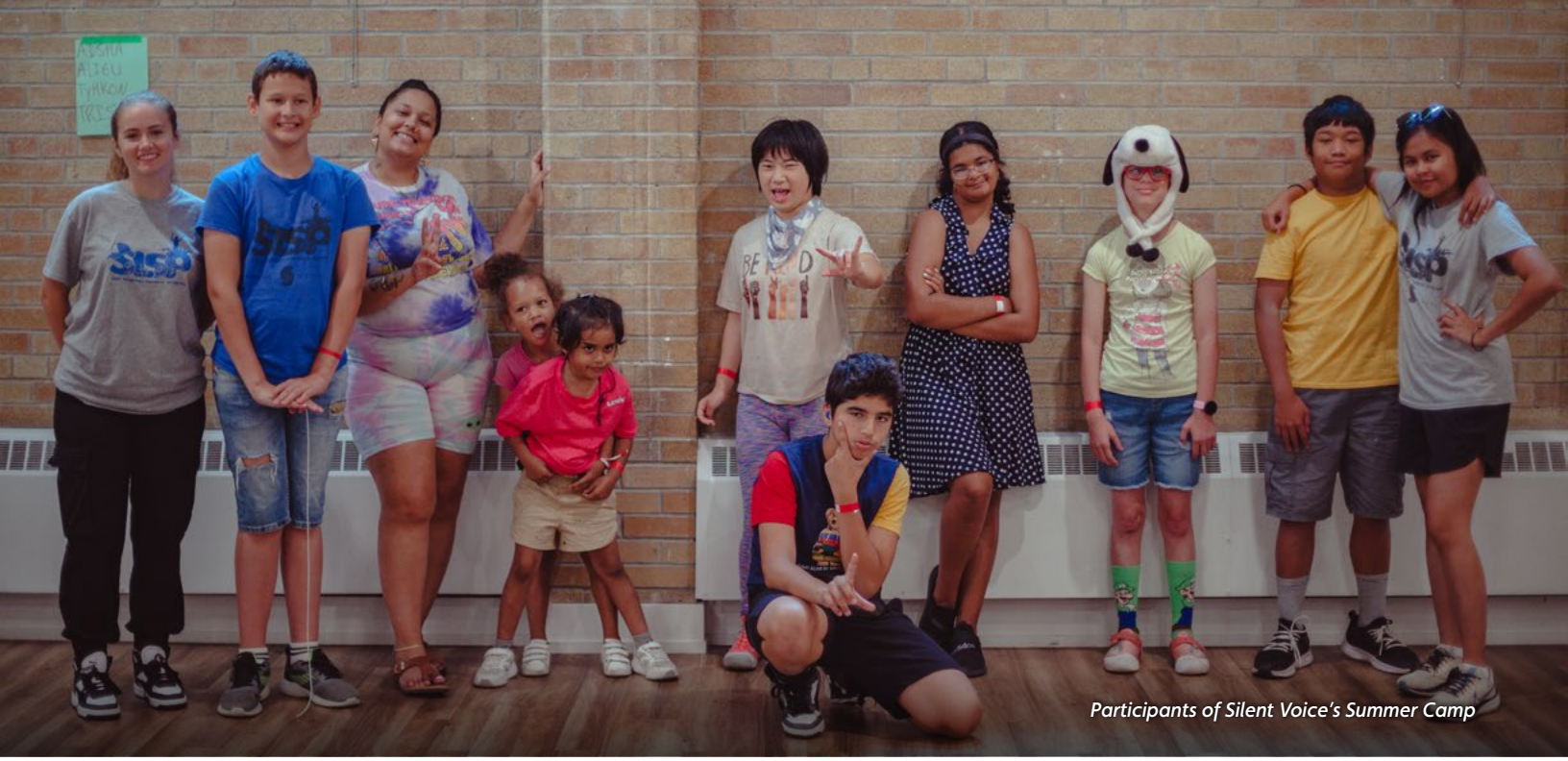
Participants of Silent Voice's Summer Camp