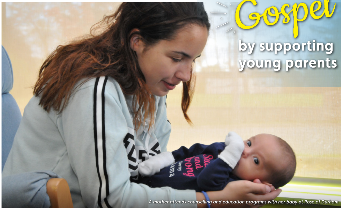
A mother attends counselling and education programs with her baby at Rose of Durham