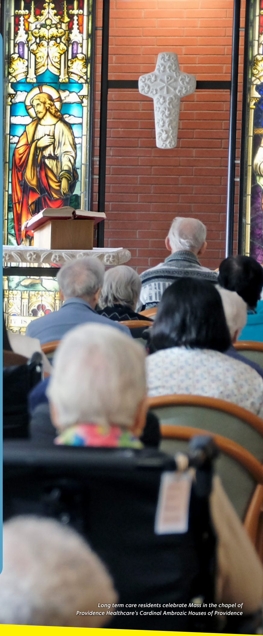
Long term care residents celebrate Mass in the chapel of Providence Healthcare's Cardinal Ambrozic Houses of Providence

We treat every gift to ShareLife as a sacred trust. By keeping our administrative and fundraising costs at 11%, we ensure the maximum amount possible goes to the work of our agencies.