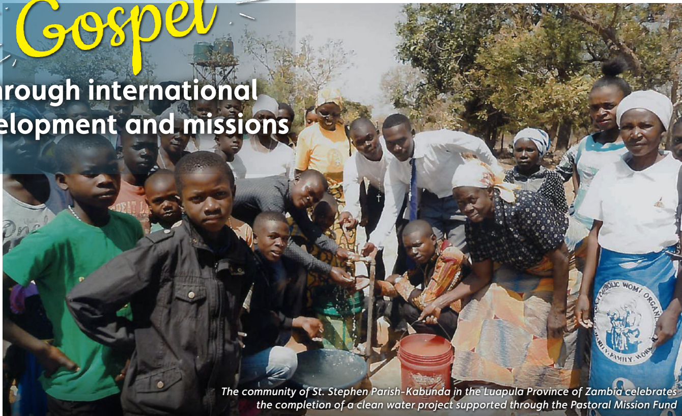
The community of St. Stephen Parish-Kabunda in the Luapula Province of Zambia celebrates the completion of a clean water project supported through the Pastoral Mission Fund